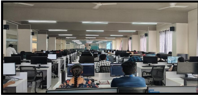
16-11-2024, 9:20 AM – 12:40 PM (ECE, CSE and CSE(AI&ML): Room No.7112)