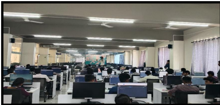
16-11-2024, 1:20 PM – 4:40 PM (EEE and CSE(AI&ML)): Room No. 7112)