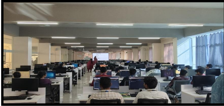
16-11-2024, 9:20 AM – 12:40 PM (ECE: Room No.7111)