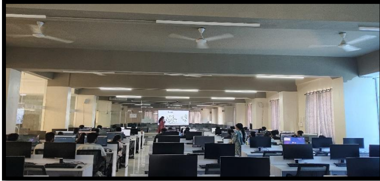
16-11-2024, 1:20 PM – 4:40 PM (AI&DS and CSE (AI&ML)): Room No. 7111)